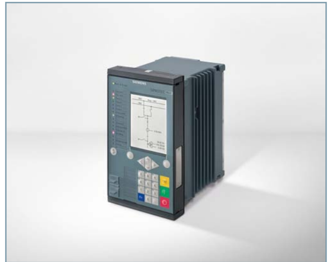
[SIP5_GD_W3, 1, --]